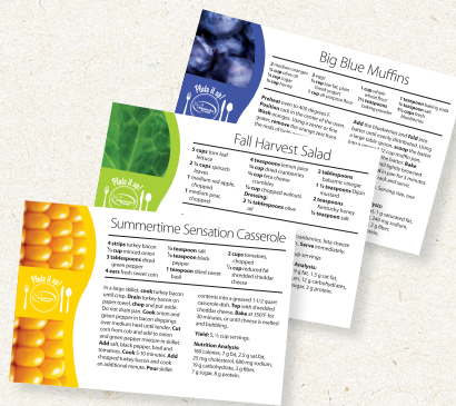
Plate it Up!

Browse and download more than 100 delicious, healthy recipes from Plate it Up Kentucky Proud.